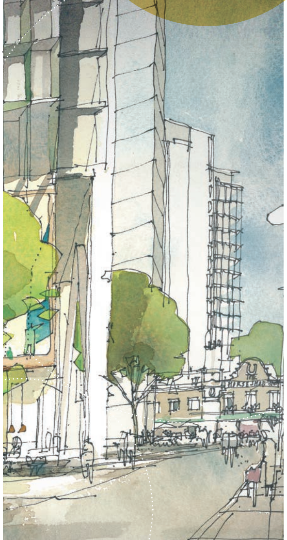
Illustrative view, Melior Street looking east

The update will provide a further look at the plans for the employment and office space as well as public realm, public open space and landscaping, which will aim to contribute to the wider regeneration of St Thomas Street.